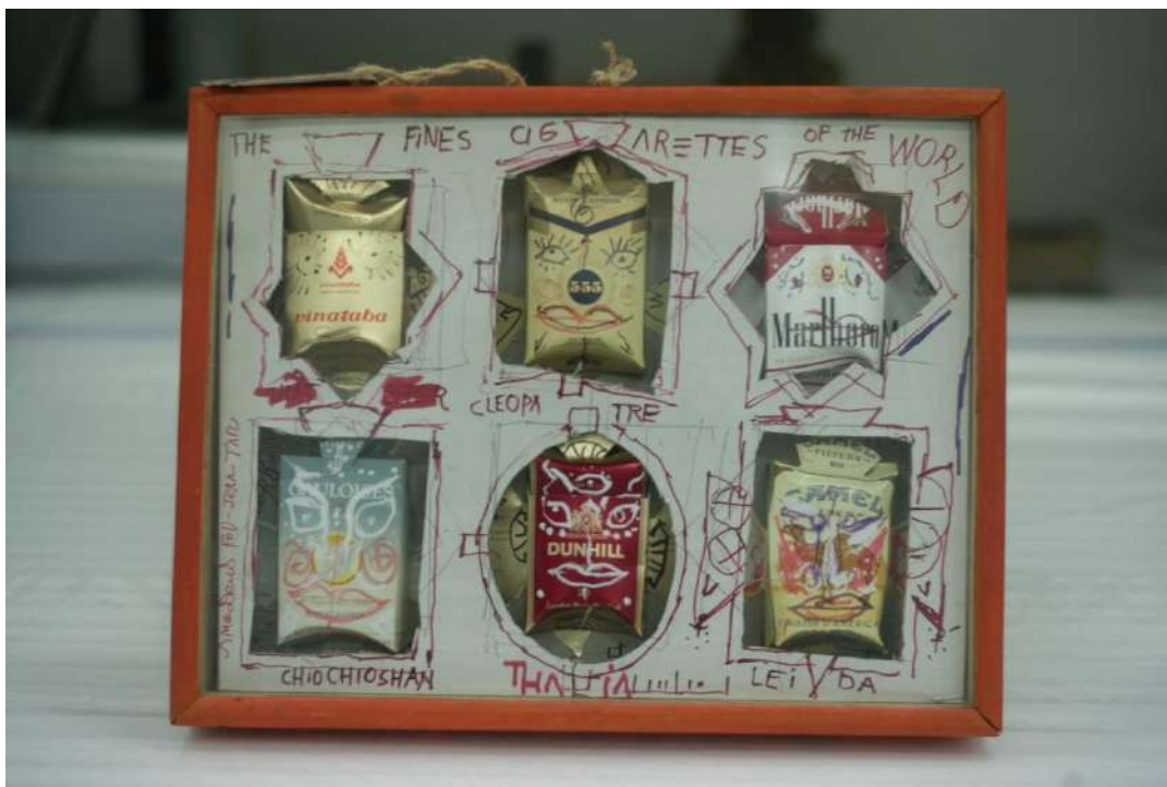
Fig. 1. Vũ Dân Tân. Suitcases of a Pilgrim. 1996. Mixed media with text, part of a series.

What did Vũ Dân Tân intend with such work? From discussions, interviews [Were 1997] and his art, one gleans his goal of making art part of dynamic, complicated life: via their new polysemic construction so distinct from descriptive painting, these early-1990s pieces cryptically raise the possibility of freedom in globalizing Vietnam.