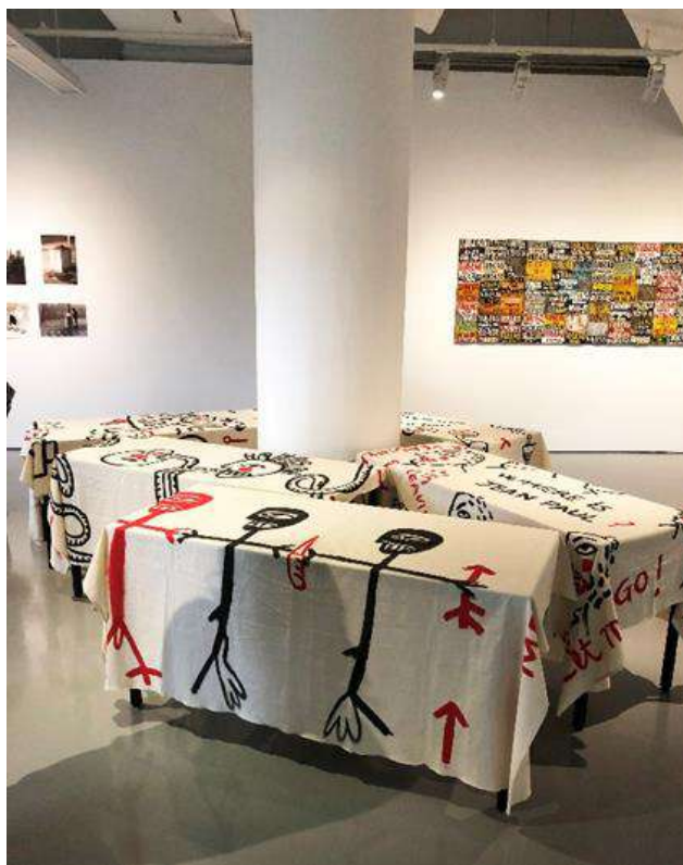
Fig. 2. Trương Tân. Nappes. 1995 Acrylic paint on cloth, part of a series.

Nguyễn Văn Cường too adopted low-art materials that derived critical function from their embedding in Vietnamese social life. Porcelain Diary , 1999–2001, which Cường produced in the ancient kiln village of Bat Trang, comprised 80 porcelain vases referencing the underbelly of globalizing Vietnam – louche bargirls; barking businessmen; disenfranchised peasants. Porcelain vases are culturally significant in Vietnam for their ritual and domestic functions, so the medium operated as a disarming foil for presenting Porcelain Diary 's rambunctious images questioning Đổi Mới sexual freedom and capitalism [Lenzi 2013: 132]. Porcelain Diary took no position, but via innovative material-iconographic alliance evoked the story of opening Vietnam too complex for mere mimetic picturing, thus embodying a new visual idiom for accessible critical engagement (Fig. 3).