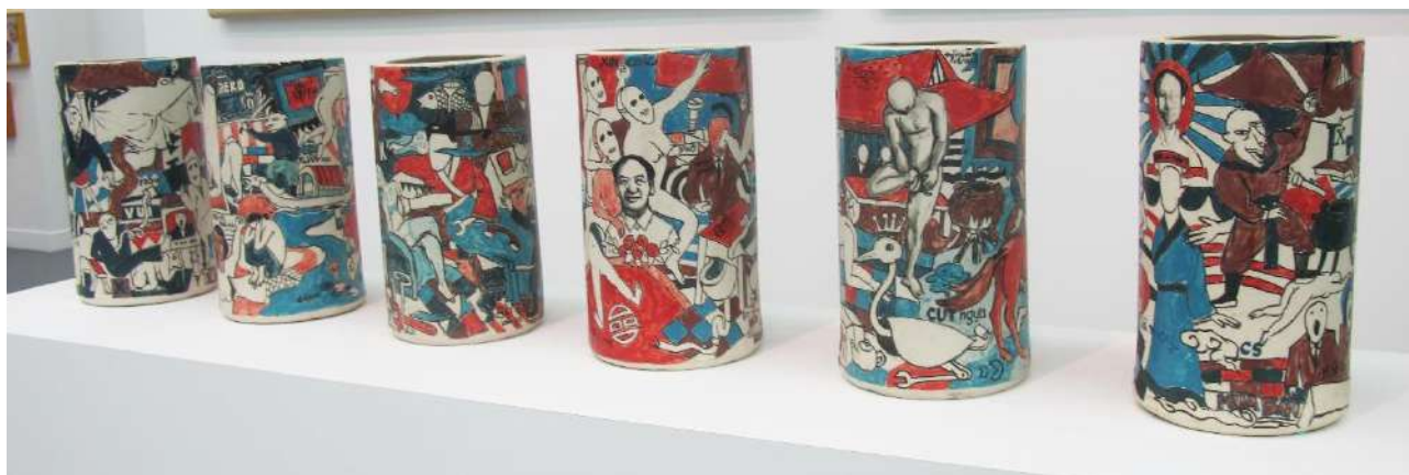
Fig. 3. Nguyễn Văn Cường. Porcelain Diary. Mixed dates, 1999, 2000, 2001. Polychrome hand-painted porcelain vases, part of series, approximately 80 pieces, 1999–2001.